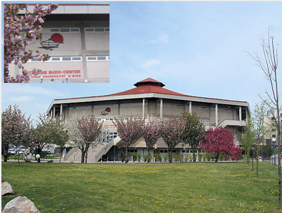
Matsumae Budocenter, Gutheil-Schodergasse 9, 1100 Wien, Austria